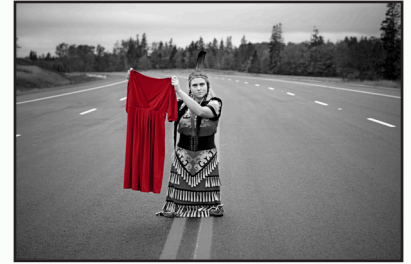
"Honouring Missing and Murdered Indigenous Women and Girls"